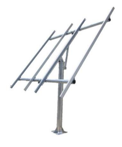
1.4KW 4 Panel Solar Mount – 10-65 deg Tilt, ground mount