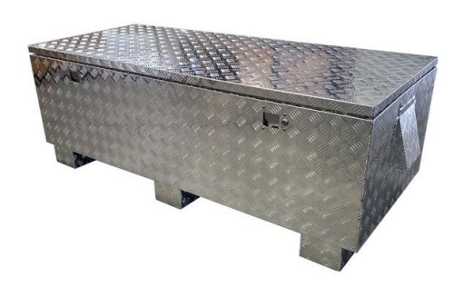
RPAL Diamond Plate Aluminum Ground Mount