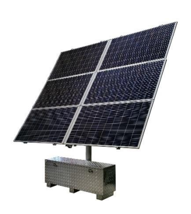
RPAL 2.1KW 6 Panel Solar System