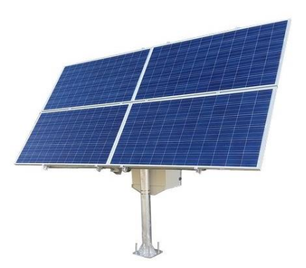
RPSTL 1.4KW 4 Panel Solar System