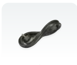
2x power cord