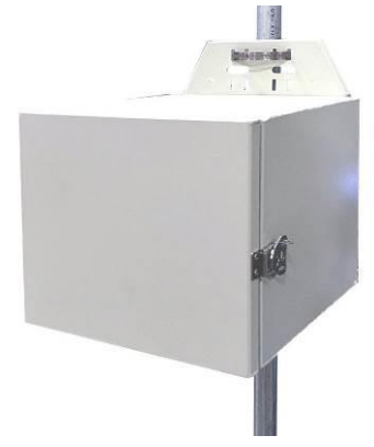
ENC-AL-12x14x15 Aluminum Enclosure

The enclosure is corrosion resistant for long service life. Enclosure material is powder coated aluminum. All hardware is stainless steel.