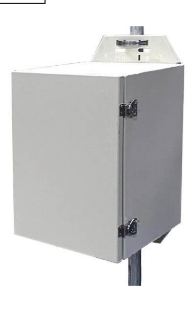
ENC-AL-21x14x15 Aluminum Enclosure