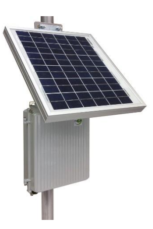
RemotePro® DC Series