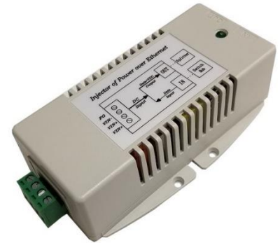
TP-DCDC-1248GD-HP 35W 802.3af/at