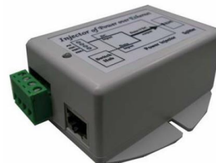
TP-DCDC-4848GD 17W 802.3af