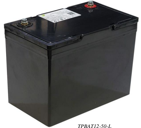
TPBAT12-50-L Lithium Battery