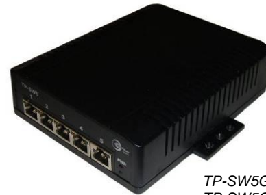
TP-SW5G (802.3af/at) TP-SW5G-NC TP-SW5G-24 (802.3af/at)