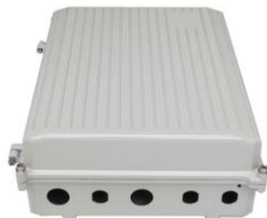
ENC-DC Bottom Panel Cutouts

Features include a hinged cover for easy access and weatherproof feedthru's for cables and wiring. The ENC-DC comes with two RJ45 feedthru which allows passing of an RJ45 connector to make the entire enclosure field replaceable. It also has three cutouts for an N Female connector for attaching external antennas. Hole Plugs are included for the N Cutouts if all aren't needed. The ENC-PL has 3 weatherproof universal cable feedthru's. The ENC-ST has four cutouts for RJ45 Feedthrus (included) and DIN rail mounts on both interior sides as well as on the door. The ENC-St also comes with a removable battery shelf.