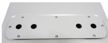
ENC-ST Bottom Panel Cutouts