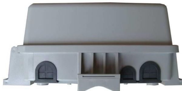
ENC-PL Bottom Panel with Universal Feedthru