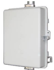
ENC-PL Polycarbonate Enclosure