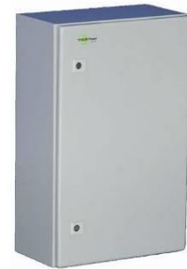
ENC-ST Steel Enclosure