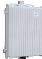
ENC-DC Die Cast Enclosure