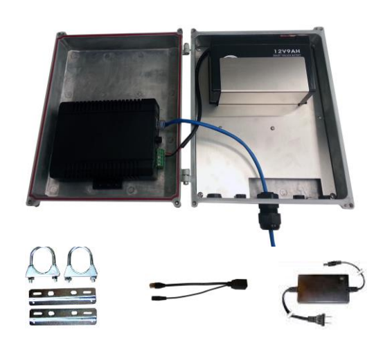
UPSPro® Die Cast Enclosure System