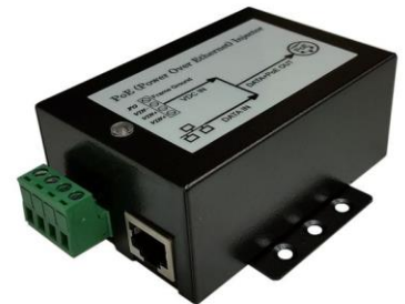
TP-DCDC-1248M (Metal Enclosure)