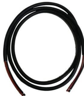
Outdoor Rated Cable