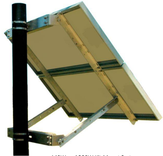
140W and 280W Kit Mount System