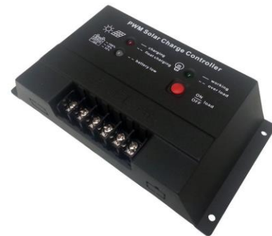
12V / 24V Solar Charge Controller